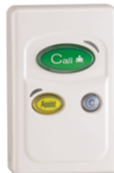
QCA032-WG 802.11b/g Wi-Fi Call and Assist Point