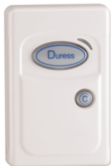
QCA026-WG 802.11b/g Wi-Fi Duress Point