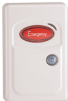
QCA022-WG 802.11b/g Wi-Fi Emergency Point