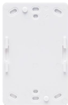
QCA-MP Australian standard sized vertical mounting plate with adhesive contact