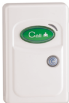
QCA021-WG 802.11b/g Wi-Fi Call Point