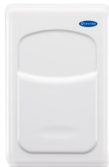
QCA-BP Australian standard sized vertical blank plate