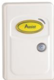
QCA024-WG 802.11b/g Wi-Fi Assist Point