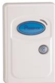
QCA023-WG 802.11b/g Wi-Fi Presence Point